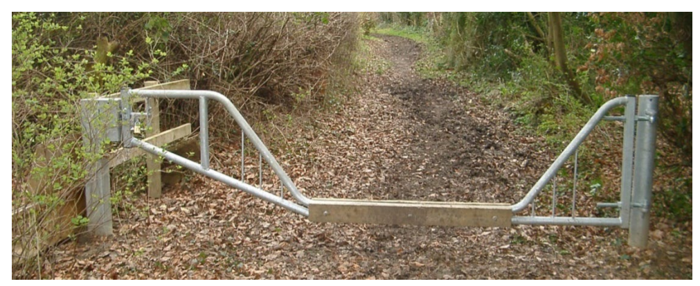
Figure 3 'Horse friendly vehicle barrier' (Centrewire))

A 'horse friendly vehicle barrier' is a term used by a manufacturer for a strong metal barrier with a lowered mid-section over which horses can step. The mid-section must be low enough that it does not encourage a horse to jump it. More robust barriers of the same pattern as that in figure 3 are available.