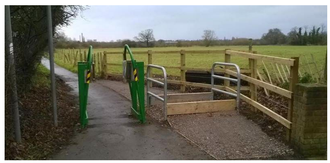
Figure 2 Horse stile BS5709

The BHS does not recommend using suspended scaffold-type poles or metal bars as they are less visible to horses and if a hoof strikes them in crossing, the noise may startle the horse. However, the Society accepts that in some locations wood is too vulnerable to vandalism but poles should not be suspended as a horse's foot may slip underneath causing a serious injury.