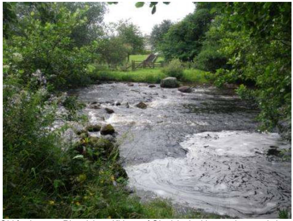
Old ford across River Isla at Kirkton of Glenisla, looking north towards hotel