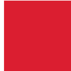
BHS Red PMS 1797