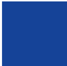
BRC Blue PMS Blue 072