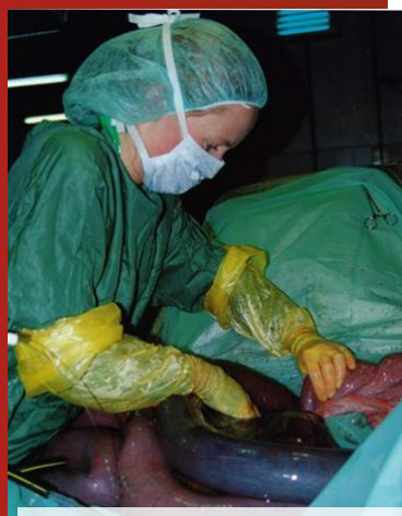
Surgery for a small intestinal strangulation

Choosing a facility that is accredited by the Royal College of Veterinary Surgeons Practice Standards Scheme as an Equine Veterinary Hospital may be a good starting point in helping decide where to refer the horse, but your own veterinary surgeon is also likely to know what facilities and expertise are available in your area.