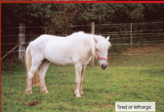
Tired or lethargic

If you have any concerns for your horse's health REACT NOW - CALL YOUR VET