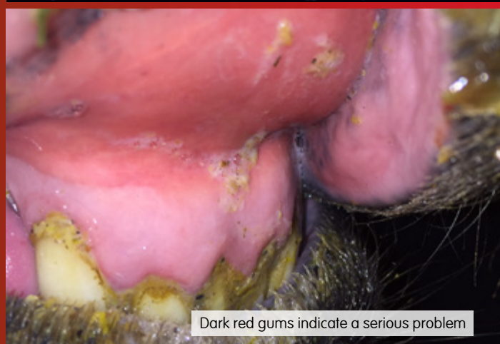
Dark red gums indicate a serious problem