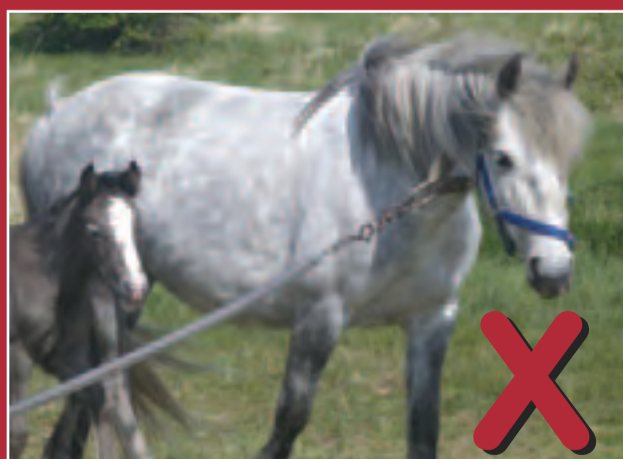
DO NOT TETHER MARES WITH A FOAL AT FOOT

If you are concerned about the welfare of a horse(s) contact the BHS Welfare team on 02476 840517 or welfare@bhs.org.uk