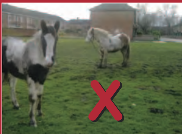
LOOSE HORSES BY A ROAD ARE DANGEROUS