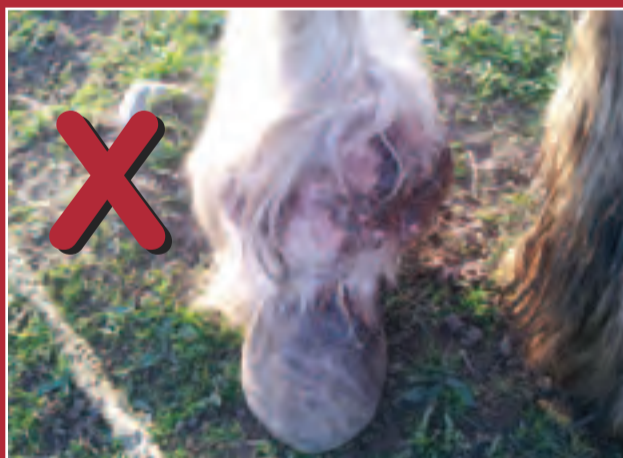
IF INJURED, OWNERS MUST CALL THE VET