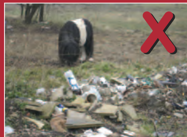
UNSUITABLE AND POTENTIALLY DANGEROUS ENVIRONMENT