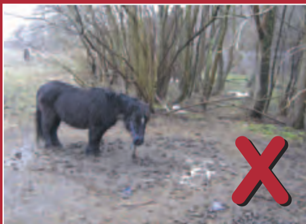
POOR AREA – HORSES MUST HAVE FOOD