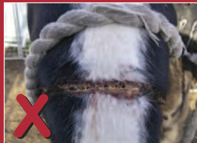
TIGHT HEADCOLLARS AND COLLARS CAUSE INJURIES