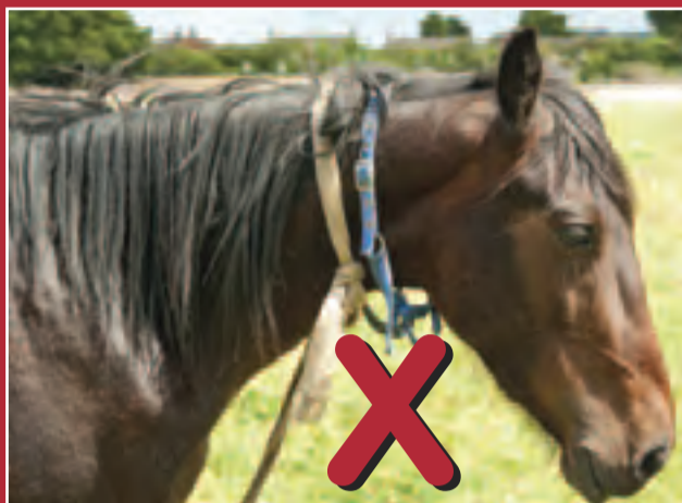
DO NOT USE ROPE/NYLON