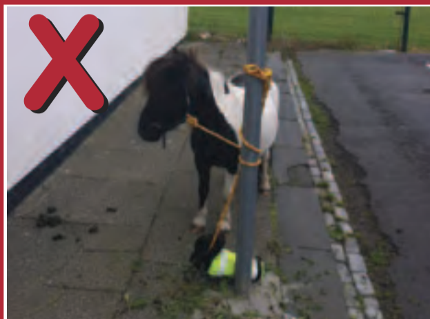
DO NOT TIE HORSES DIRECTLY TO TREES/FENCES/LAMP POSTS