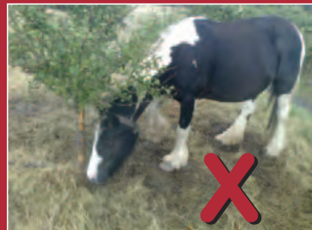
DO NOT ALLOW HORSES TO GET CAUGHT UP IN TREES