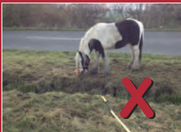
DO NOT LET HORSES GET TOO CLOSE TO THE ROAD/RIGHTS OF WAY