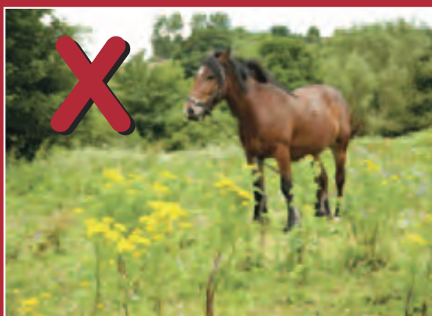
DO NOT TETHER NEAR RAGWORT