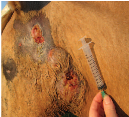
Abscessed lymph nodes at the base of the head

Even if you take all the necessary precautions, there is still a chance a horse may become infected with S. equi , especially as some horses