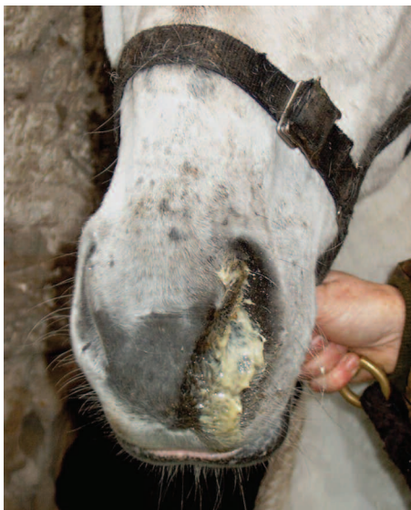
Muco-purulent nasal discharge typical of strangles