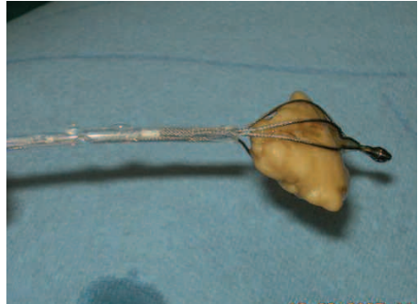
Chondroid removed from a guttural pouch with transendoscopic basket forceps

to normal activities until after all horses are confirmed to be uninfected. Animals still testing positive for S. equi will be required to remain in isolation until they are shown to have gone negative, which may require treatment appropriate for persistent infection such as of the guttural pouches.