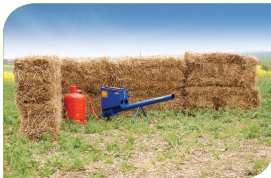
Auditory scarer with baffles

Some scarers and deterrents combine sound and visual stimuli.