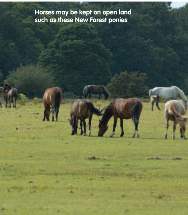
Horses may be kept on open land such as these New Forest ponies

There are situations where it appears that stock are kept in a field or gates are poorly maintained deliberately to deter riders. If this is the case, the highway authority has the power and the duty to take action to keep the right of way open and easy to use. Improvement of gates can be enforced under the Highways Act 1980; animals making a route hazardous or difficult to pass can be a statutory nuisance under the Environmental Protection Act 1990 and dangerous animals are dealt with by the Animals Act 1971.