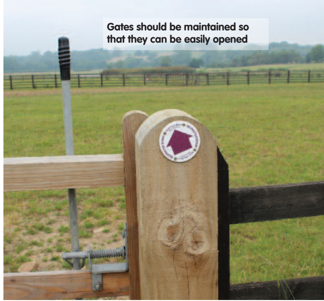
Gates should be maintained so that they can be easily opened

If a problem with livestock is serious and you are not able to contact the owner, or are unable to reach a satisfactory conclusion, your next call should be to your local