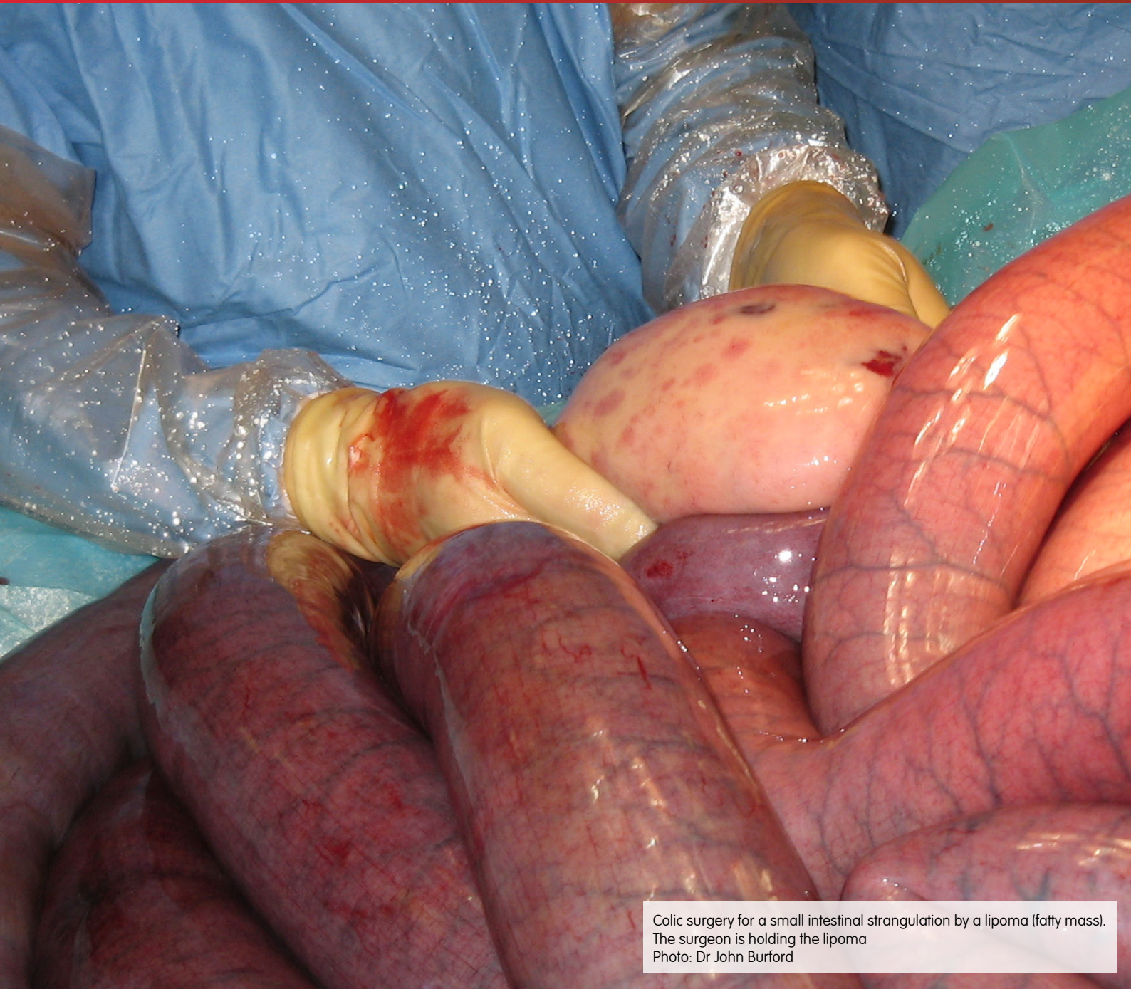
Colic surgery for a small intestinal strangulation by a lipoma (fatty mass). The surgeon is holding the lipoma

There are a range of different causes of strangulations and torsions. However, both types of colic can be severe and surgery will be required urgently. Horses usually show severe and continuous signs of pain, and/or signs of shock (including sweating, dullness and depression).